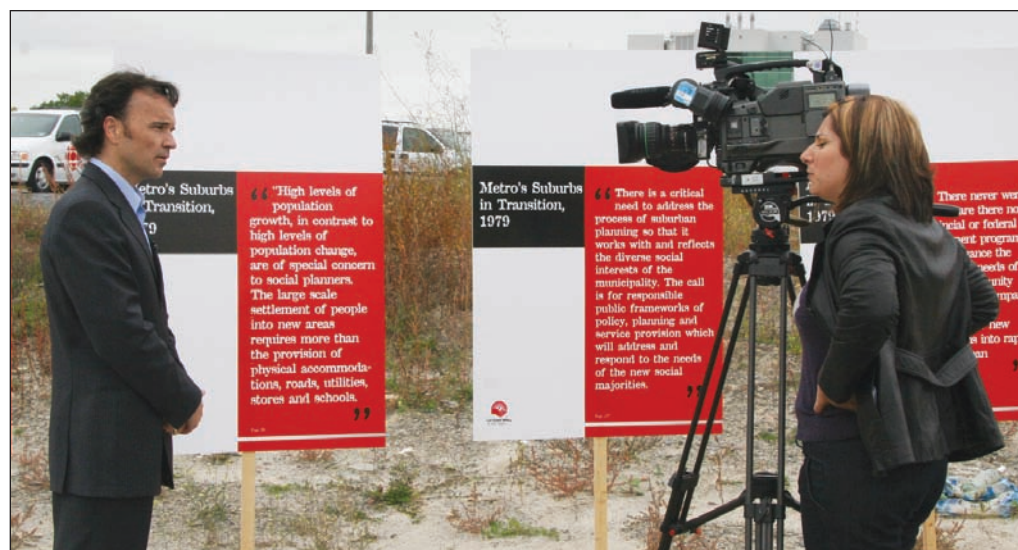
CBC TV Reporter Lucy Lopez covers impact of growth on social services in York Region, September 29, 2008