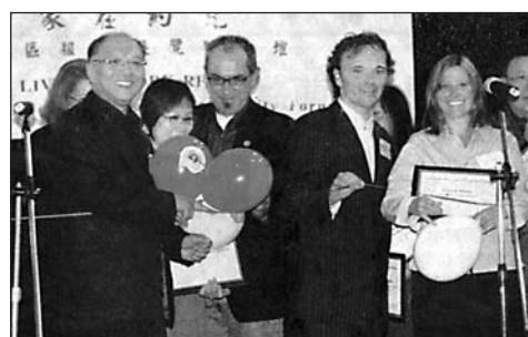
Living in York Region Chinese Fair, October 4, 2008

From Richmond Hill to Georgina, King to Whitchurch-Stouffville and all municipalities in between, residents, employees, corporations, and community groups wholeheartedly accepted the invitation to join the United Way of York Region in a week of celebration across our remarkable region. And what a week it was.